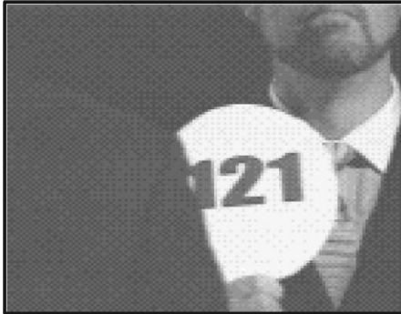
[Auctioneer]: "I've got 300, now 320..." [Announcer]: A Washington D.C. special interest group has already pumped a half million dollars