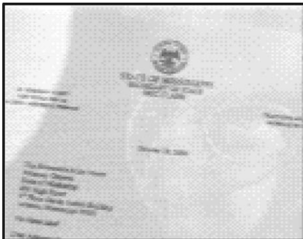
has asked the attorney general to investigate these questionable expenditures. Do they think