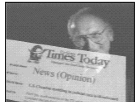
Mississippi Supreme Court is not for sale. [Announcer2]: On November 7, vote for the candidate who's not for