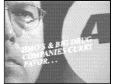
to listen when the HMO's and big drug companies need a favor. The secretary of state