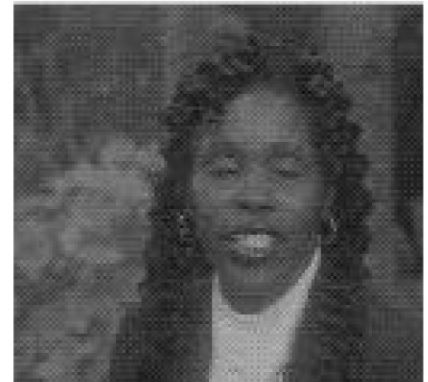
and my child when no one else would. He's a good man who cares about people."