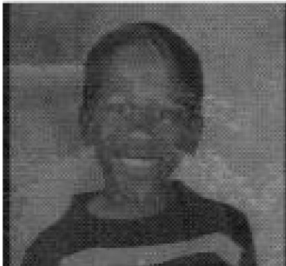
was badly injured in a bus accident. I made the insurance company, not the