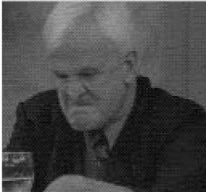
[Announcer]: [Unintelligible] a special interest group set up by a [unintelligible]