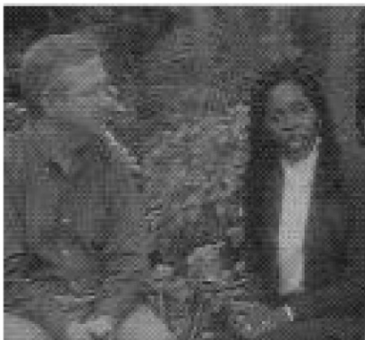
[Announcer]: The Citizens for Truth in Government should be ashamed of themselves.