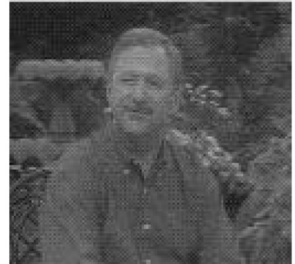
said I sued a church. The truth is I helped a working mother whose child