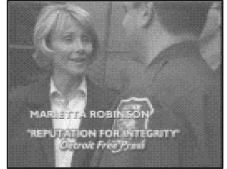
reputation for integrity. The only Michigan woman chosen as one of the