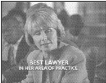
best lawyers in America. [Man]: "She's tough, tough on crime." [Woman]: "She