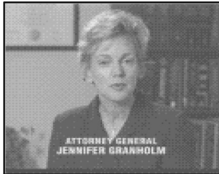
will be a tremendous Supreme Court Justice." [Granholm]: "No one is more qualified