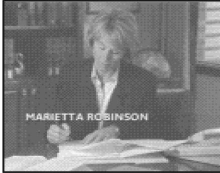
advocates for working families, winning 98% of her cases. A