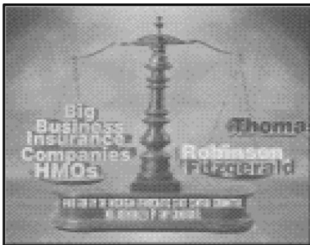
Your vote can restore the balance."