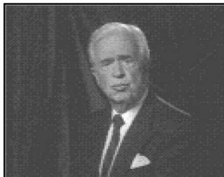
when special interest groups use sleeze on these fine people."