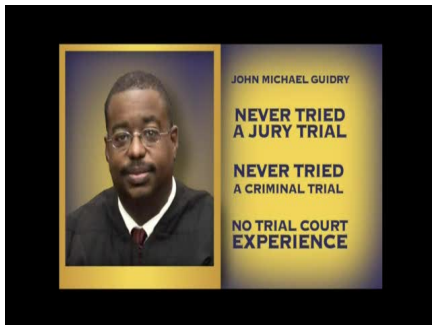
His opponent never tried a jury trial, never tried a criminal case, zero years trial court experience