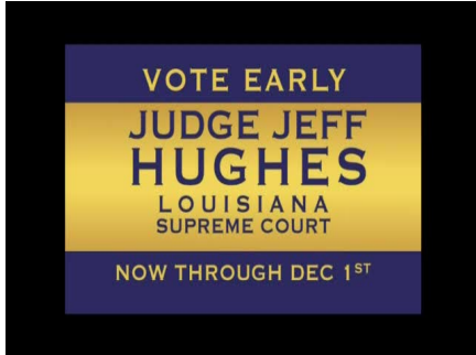
Louisiana Supreme Court, vote early!

Brand: Pol-Supreme Court - (B333) Parent: POLITICAL ADV Aired: 11/28/2012 11:20:30 PM Creative Id: 11831020