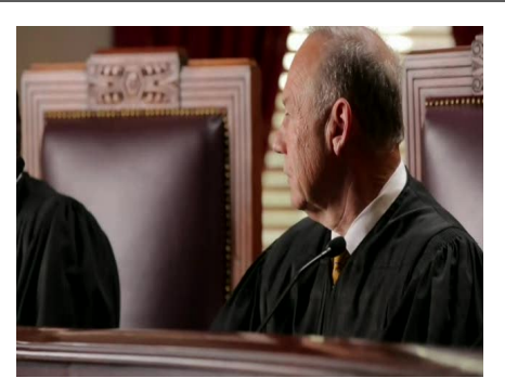
He stared down criminals as a no nonsense prosecutor