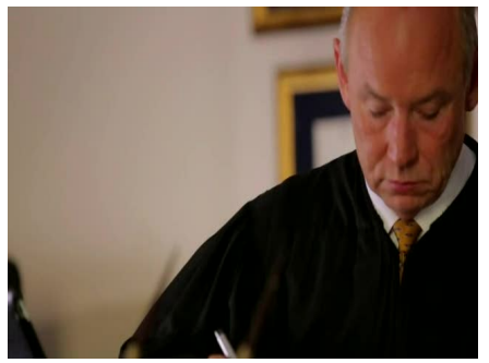
Our next Louisiana Supreme Court Justice must have judicial experience. With six judges seeking the state's top court, consider this impressive history