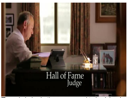
The only judge in the race named to Louisiana's Justice Hall of Fame