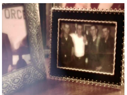
As our nation counted down to conflict, Duke was a young airman trusted at NATO with top secret security