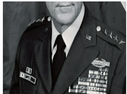
When I was in NATO with the death con three