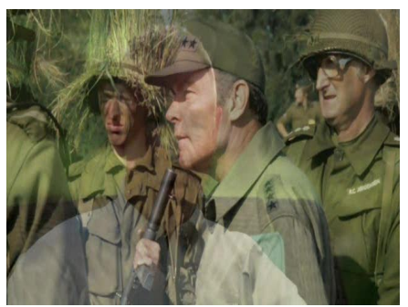
we acutally opened up the safe and broke out the NATO battle plans