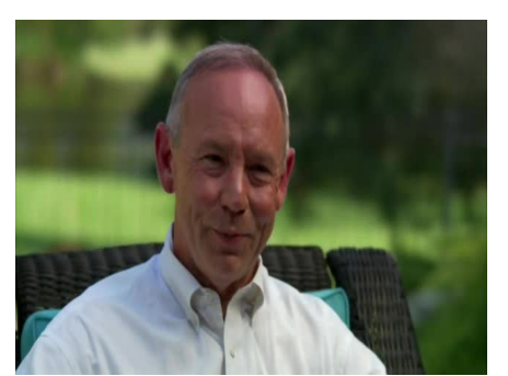
I have the educational background, the legal experience, the judicial experience, coupled with the knowledge of people