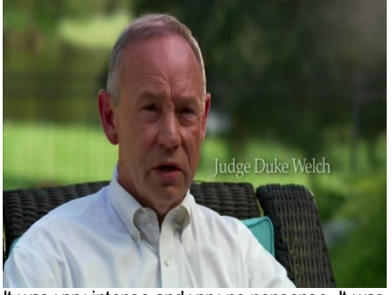
It was very intense and very no nonsense. It was real.