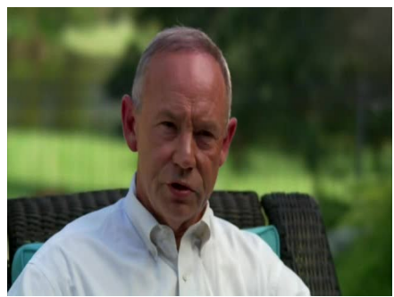
This profession is one of the greatest experiences that a lawyer can have