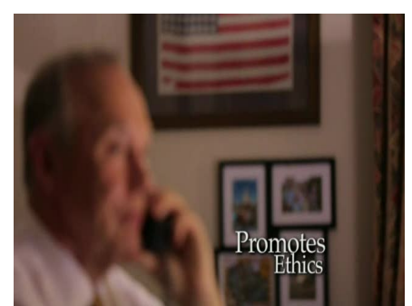
The only judge selected by his peers to promote ethics