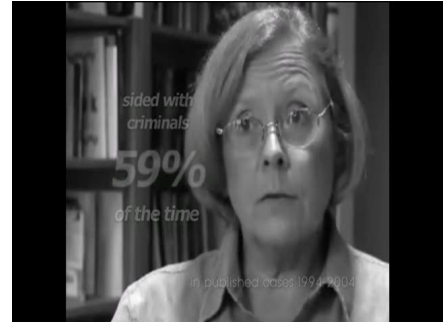
Former Justice Janet Stumbo sided with criminals fifty-nine percent of the time