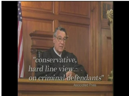
Current Justice Will T. Scott takes a conservative, hard-line view on criminal defendents