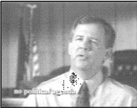
political agenda. I believe that I'm a conservative judge who