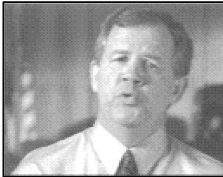
will strictly interpret the law, apply the law without showing any special