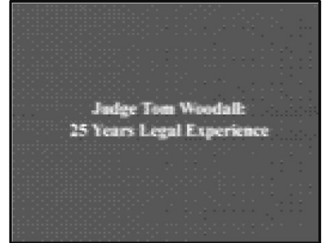
and at all times to act without any kind of personal or