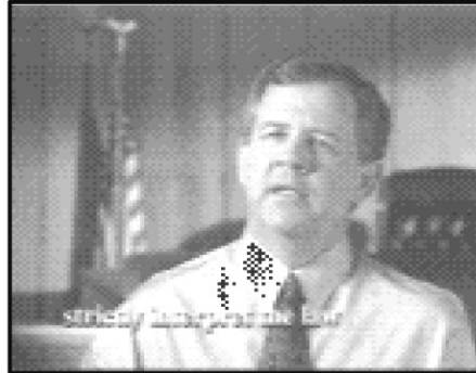
to not show any special favor to any party,