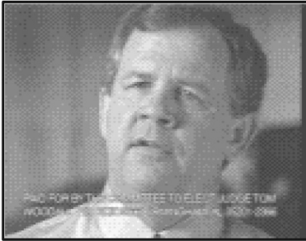
[Woodall]: " I believe I take a balanced approach in what I do because I don't have any personal