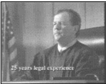
follow the law, then maybe he needs to worry about what people say