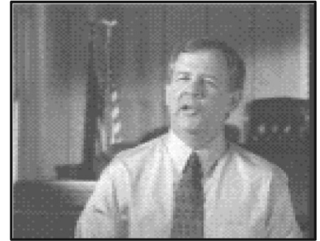
I can't really worry about what people say or what they think. But if the judge doesn't