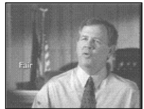
tried to be reasonable and I've always been honest. I believe if you do that, you can have the kind of reputation you