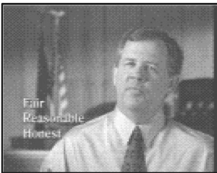
can be proud of."