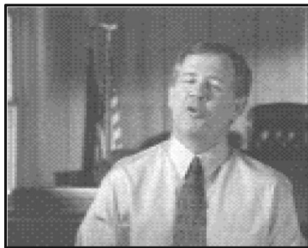
or what they think. I know I have always tried to be fair. I have always