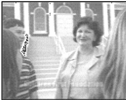
founding member of the Children First Foundation, a conservative circuit judge,