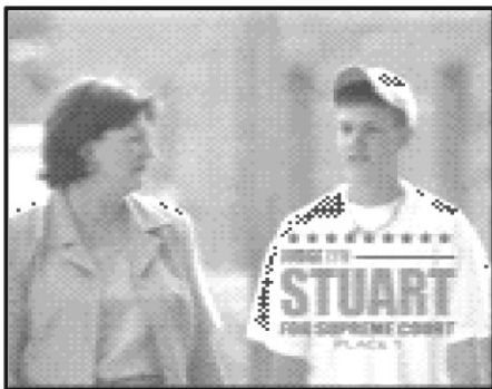
to defending and protecting Alabama's children.