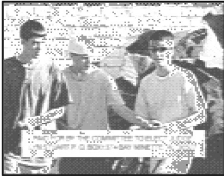
[Announcer]: Alabama children at risk, truant from school, one step away from serious trouble. Many were brought before Judge