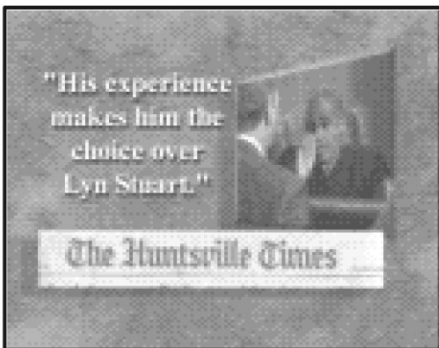
the choice over Lyn Stuart. Ralph Cook possesses a keen legal