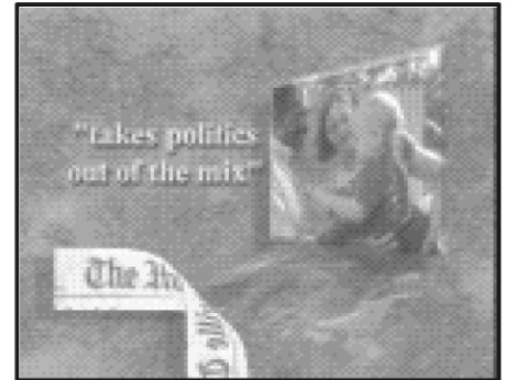
He tries to take politics out of the mix. His experience makes him