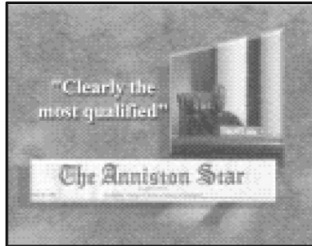
the most qualified. His opponent has half as much experience.