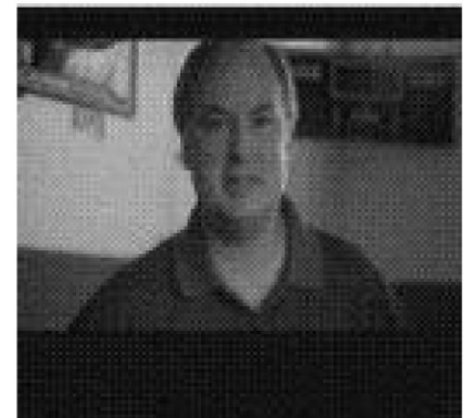
that's about as honest as this