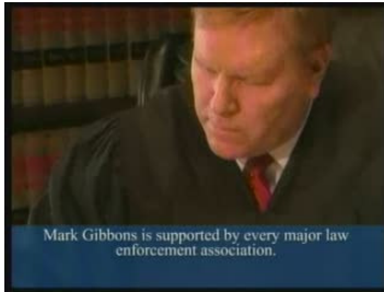
Perhaps that is why every major law enforcement association in Nevada