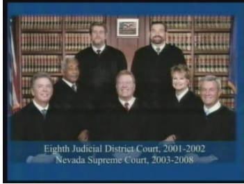
has years of experience on the bench.