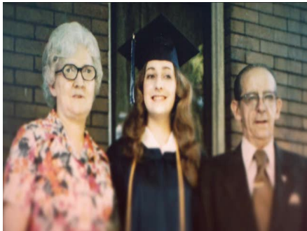
DAUGHTER OF A STEEL WORKER,