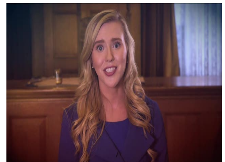
MY MOM PROTECTS OUR CHILDREN, SAFEGUARDS OUR SENIORS, AND PROMOTES JUSTICE FOR VETERANS.