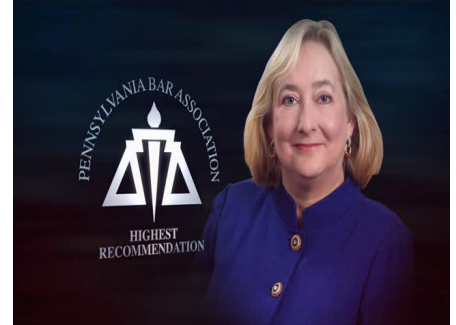
THE STATE BAR GIVES HER HIGHEST RECOMMENDATION.