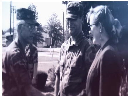
WIFE OF A VETERAN.