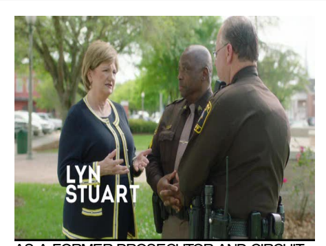
AS A FORMER PROSECUTOR AND CIRCUIT AND DISTRICT JUDGE, SHE EARNED A REPUTATION FOR BEING TOUGH ON CRIMINALS.