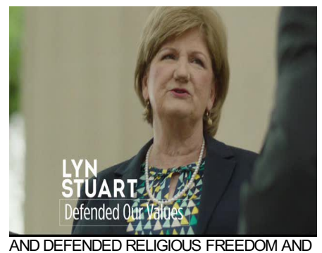
AND DEFENDED RELIGIOUS FREEDOM AND MARRIAGE.