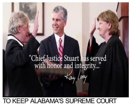
TO KEEP ALABAMA'S SUPREME COURT CONSERVATIVE