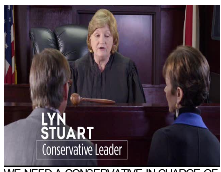
WE NEED A CONSERVATIVE IN CHARGE OF ALABAMA'S SUPREME COURT.