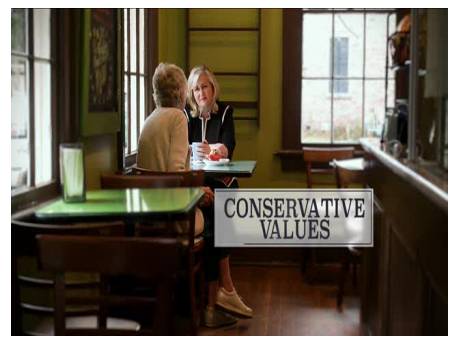
AND THE CONSERVATIVE VALUES HARD WORKING ALABAMIANS HOLD DEAR.