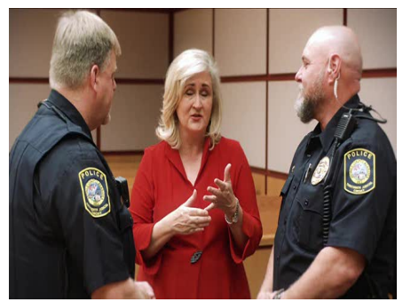
AND KNOWS HER JOB IS TO APPLY THE LAW, NOT MAKE IT.