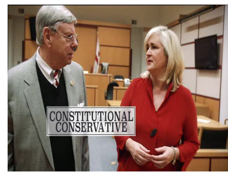
JUDGE STEWART BELIEVES IN THE CONSTITUTION