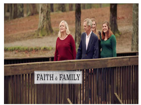
SHE IS GUIDED BY A STRONG COMMITMENT TO HER FAITH AND FAMILY.