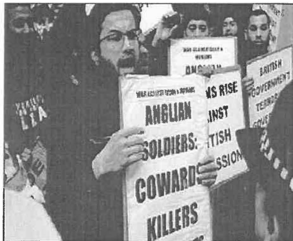
(U) British Muslims protesting British military involvement in Afghanistan.

Al-Qa'ida implicitly piggybacks on claims made mostly by nonextremists that Western values, individualism, cultural practices, and popular culture are designed to encourage vice and thereby undermine traditional Islamic values and identity. Al-Qa'ida senior leaders regularly assert that Western bribes, corruption by power, and moral permissiveness have swayed many Muslim leaders and unwitting ordinary Muslims to betray Islam.