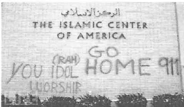
(U) Graffiti written on an Islamic Center building exemplifies intolerance and hostility perceived by some Muslim Americans.

(U//FOUO) Broad Common Grievances. Al-Qa'ida and like-minded groups fan a number of common grievances and use them as a justification for