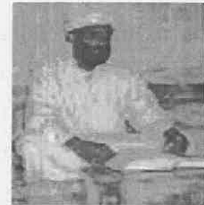
(U) Anwar al-Aulaqi

(U//FOUO) Anwar al-Aulaqi's unique blend of charisma, ability to reason with English-speaking audiences fluently, marketing skills, and experience with Western society are the key factors driving