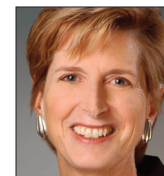
Christine Todd Whitman | Former NJ Governor and EPA Administrator | 2018 Legacy Award Honoree