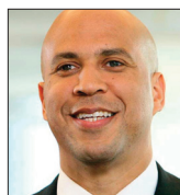
Cory Booker | United States Senator for New Jersey | 2010 Legacy Award Honoree