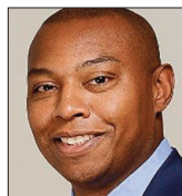
Caron Butler | NBA Champion and Advocate