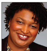
Stacey Abrams | Chair, Fair Fight Action