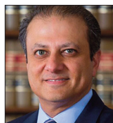
Preet Bharara | Former U.S. Attorney | 2018 Legacy Award Honoree