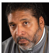
Rev. Dr. William J. Barber, II | President, Repairers of the Breach | 2017 Legacy Award Honoree