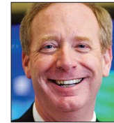
Brad Smith | President, Microsoft | 2014 Legacy Award Honoree