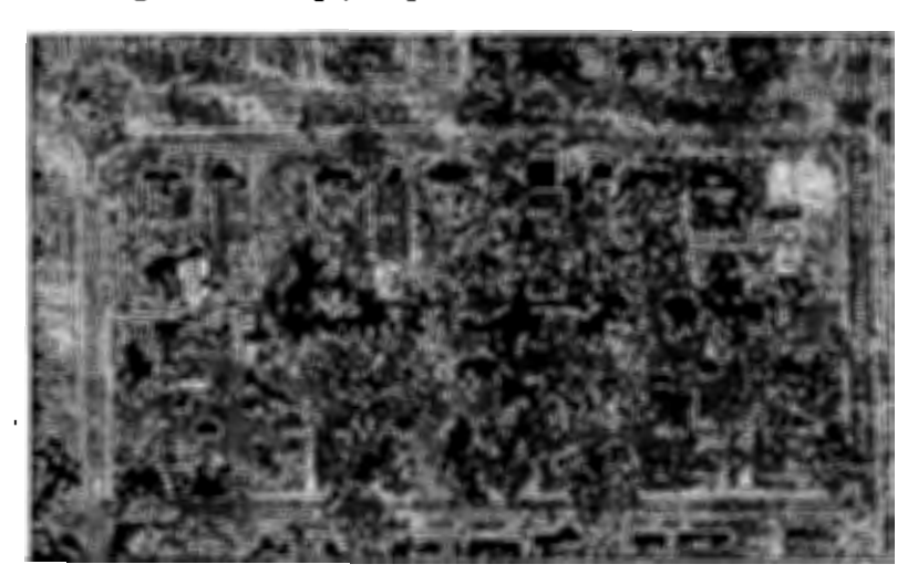
Id. at 13. The application of differential privacy likewise "turned 30,338 blocks with one or more [people of voting age] into blocks with zero [people of voting age.]" Id. at 11.

Block 010970024001008 is a tree lined single family neighborhood in Mobile south of US 90 where again it is simply implausible that no adults live here.