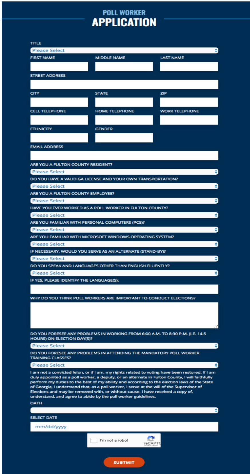
Figure 1: Example of Georgia Poll officer Application (Fulton County, GA) 21