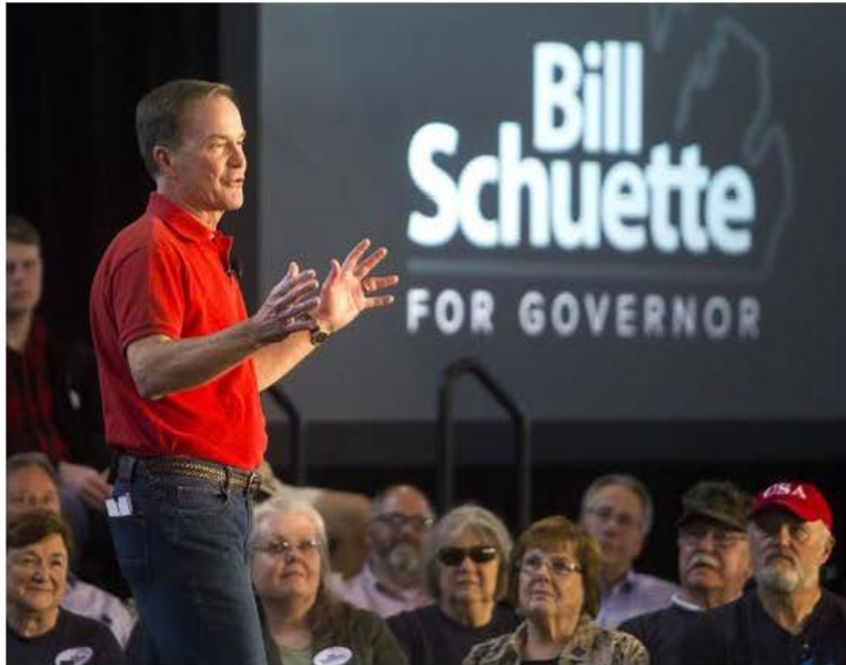
Michigan Attorney General Bill Schuette of Midland announces his gubernatorial campaign Tuesday, Sept. 12, 2017, at the Midland County Fairgrounds in Midland.

Schuette's two predecessors — Republican Attorney General Mike Cox and Democratic Attorney General Jennifer Granholm — did not have these positions, though Cox had a director of constituent relations near the end of his eight years in office, state records show.