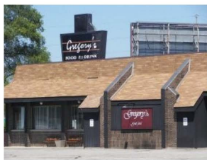
Gregory's Soul Food, Lansing

As its unassuming proprietor moves around the dining area talking with staff and tucking chairs neatly at tables, his customers, one by one, mosey over to him and exchange pleasantries.