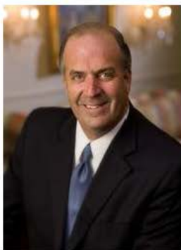
Dan Kildee is the U.S. Rep. for Michigan's Fifth Congressional District.

It worked for U.S. Rep. Dan Kildee, too. The Flint Democrat was elected to Congress in 2012, filling the spot his uncle Dale Kildee held for more than three decades.