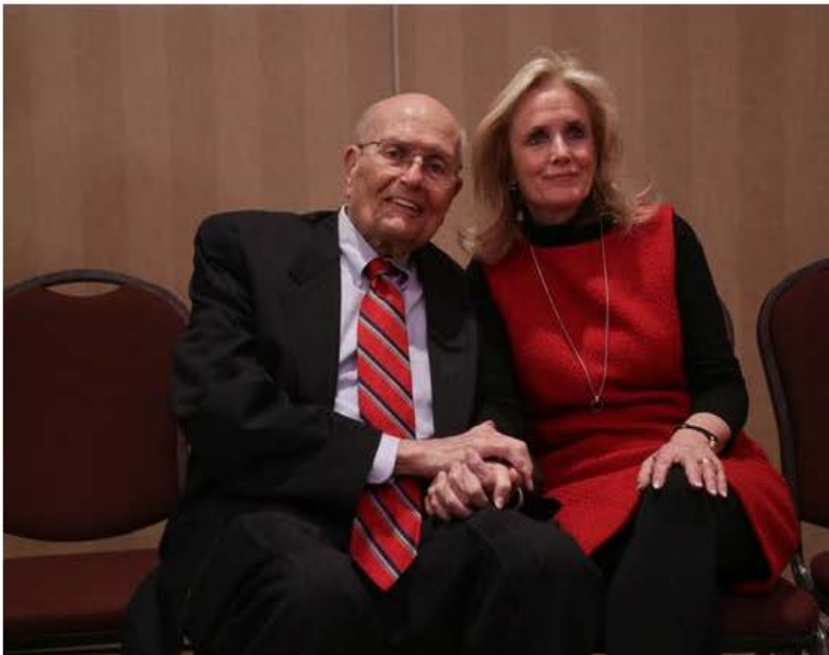
2014 FILE PHOTO -- U.S. Rep. John Dingell and his wife, Debbie Dingell, pose for a photo following a luncheon where Dingell addressed his retirement as the longest-serving member of Congress Southgate on Feb. 24, 2014.

When John Dingell Jr. retired in 2015, his wife, Debbie Dingell, ran for and won the 12th Congressional District seat she still holds.