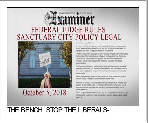
THE BENCH. STOP THE LIBERALS-