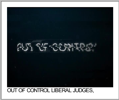
OUT OF CONTROL LIBERAL JUDGES,

Brand: Pol-Supreme Court - (B333) Parent: POLITICAL ADV Aired: 10/16/2018 12:58:57 PM Creative Id: 20183225