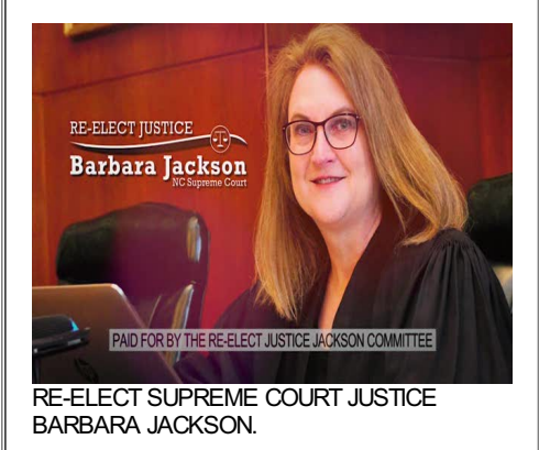
RE-ELECT SUPREME COURT JUSTICE BARBARA JACKSON.