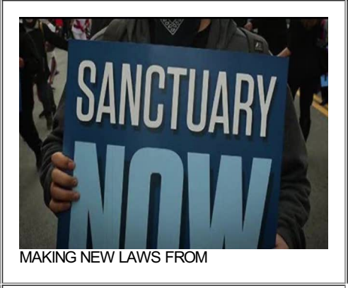
MAKING NEW LAWS FROM