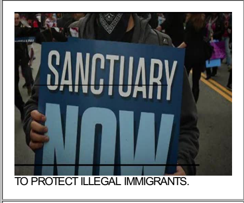
TO PROTECT ILLEGAL IMMIGRANTS.