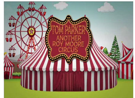
WE DON'T NEED ANOTHER ROY MOORE CIRCUS.