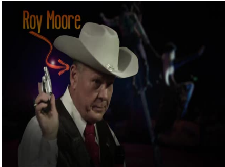
WHEN ROY MOORE WAS REMOVED FROM OFFICE TWICE,