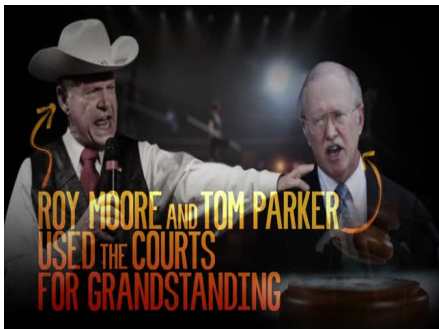
USED ALABAMA'S SUPREME COURT FOR POLITICAL GRANDSTANDING,