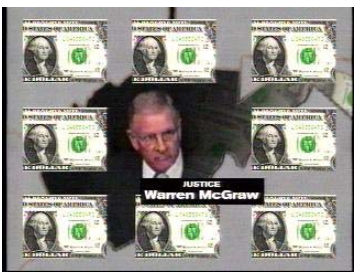
The lawyers give McGraw thousands of campaign dollars. Then McGraw rules for them.