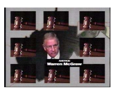
The lawyers get rich and you pay the price.