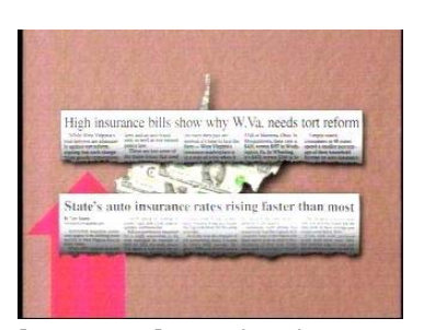
[Announcer]: Frivolous lawsuits are causing our car insurance bills to go higher and higher.