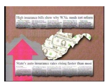
25% percent higher than some neighboring states. And Justice Warren