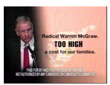
[PFB]: And For the Sake of the Kids