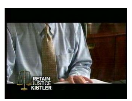
[Announcer]: Who can we trust on Oregon's Supreme Court? Justice Rives Kistler.