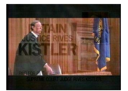
from practicing law in Oregon. It's the highest court in Oregon. It's