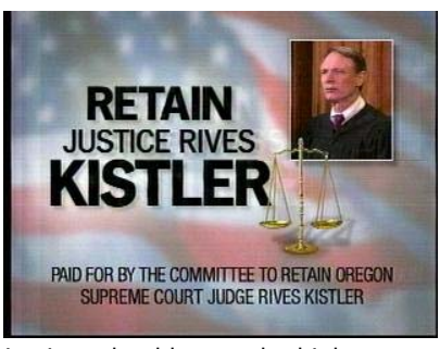
justices should meet the highest standards. Retain Justice Rives Kistler. [PFB: The Committee to Retain Oregon Supreme Court Judge Rives Kistler]