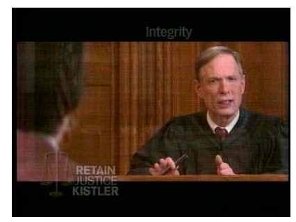
and integrity. He has strong support of law enforcement, leaders of both parties,