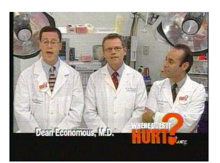
opinion about who to support for the Ohio Supreme Court ask your doctor. Why?"