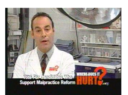
our current system of malpractice law." [Man3]:"We've documented that many