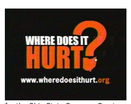
for the Ohio State Supreme Court or visit wheredoesithurt.org." [PFB: Where Does It Hurt, Org.]