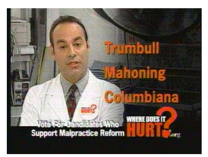
you need to vote for candidates who would support legislation that would help reform