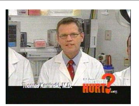
[Man1]: "In medicine a second opinion can be valuable." [Man2]:"For a second