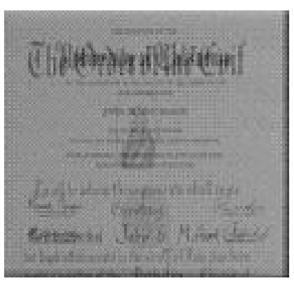
in his family and went on to become a prominent entertainment attorney