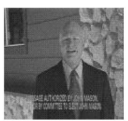
Supreme Court." [Announcer]: The son of a buthcer and a grocery store clerk,