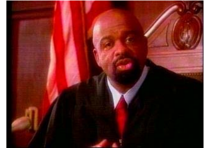
reading lamps." [Announcer]: Judge James Graves.