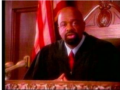
to step up to our responsibilities as parents. Lets turn off the headphones and turn on the