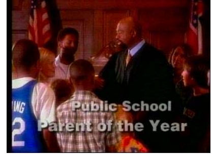
Parent of the year. That's why he speaks out about men's obligation to their children and