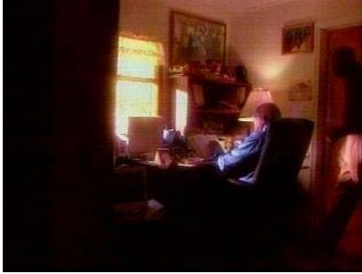
[Announcer]: Raised by a Baptist minister father, with an iron hand

Brand: POL-SUPREME COURT (B333) Parent: POLITICAL ADV Aired: 10/12/2004 - 10/12/2004 Creative Id: 3590165