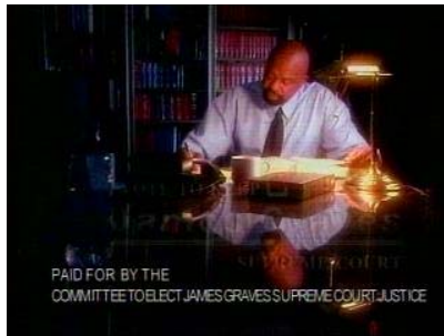
Hard work. No excuses.