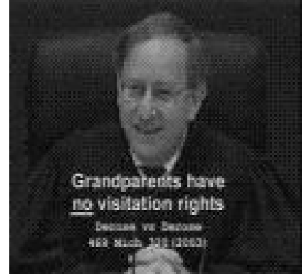
Court grandparents have no rights.