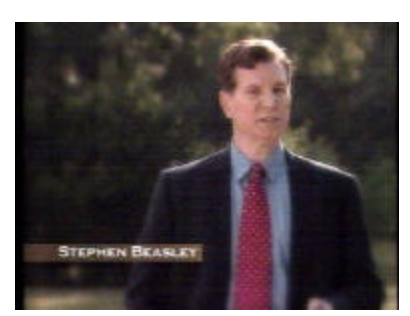
One side is not always right. Small business and working people deserve a fair shot in the