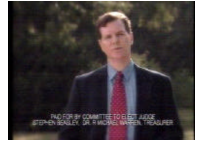
A judge must treat everyone the same. That's why I'm running for the Supreme Court.