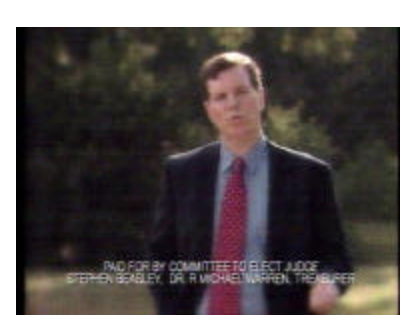
[Beasley]: "All anyone really wants from a judge is to be treated fairly.