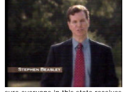
sure everyone in this state receives fair and impartial justice in