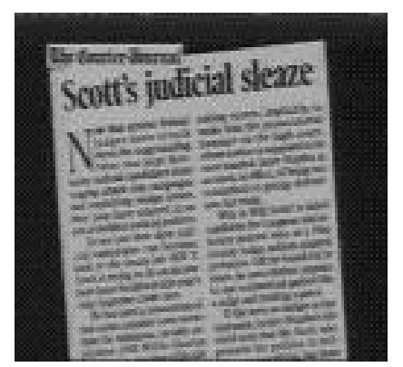
trying to do on incumbent Janet Stumbo-His ads are nauseating.