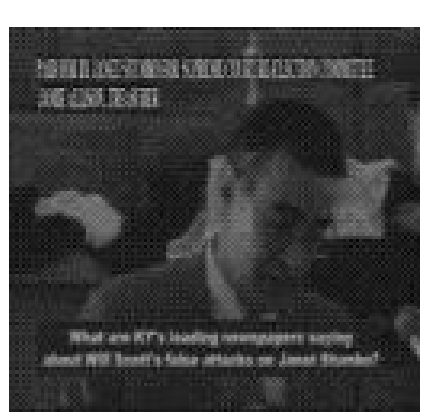
false attacks on Janet Stumbo? In an editorial entitled 'Scott's