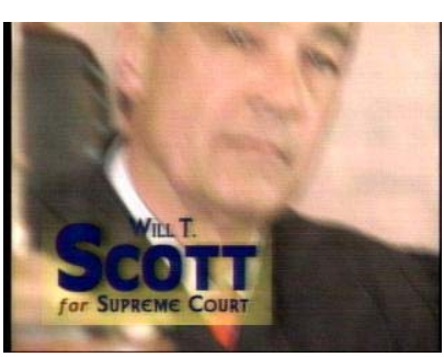
children there was justice at the end of Judge Scott's gavel. [PFB: Scott for Supreme Court]