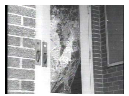
debris falling from the ceiling, and unsafe fire escapes.