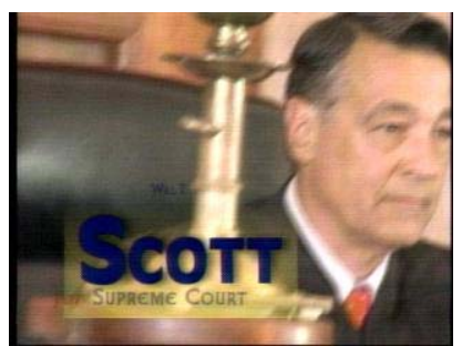
to clean up the mess and fix the school right. For those