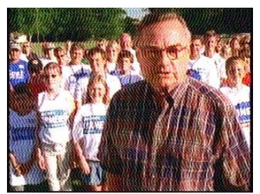
change our course for our families." [Crowd]: "We're behind you Judge