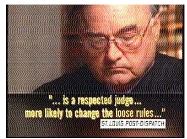
a first step towards reform. [Man2]: "He's exactly the kind of judge we need on the