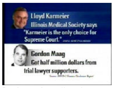
For change choose Karmeier.