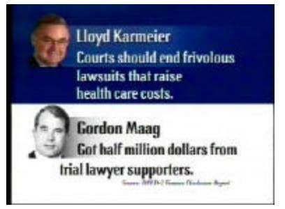
for Supreme Court. Maag will keep the current broken system.