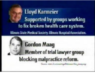
Karmeier believes courts should end frivolous lawsuits.