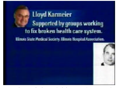
member of the trial lawyer's association that is blocking malpractice reform.