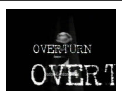
man who sexually assaulted a 6 year old girl. [Announcer2]: Maag