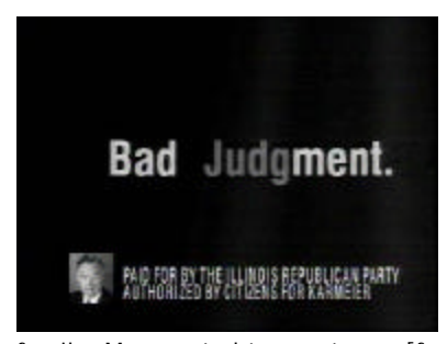
family, Maag voted to overturn...[fades out] [PFB]: Illinois Republican Party