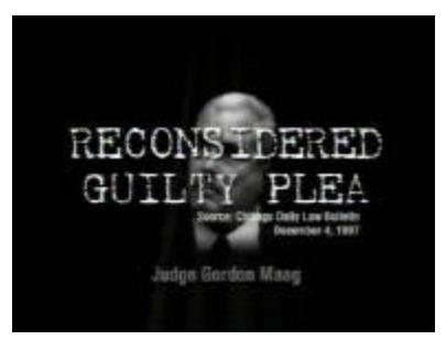
with a hatchet and steel bar. [Announcer1]: Voted to reconsider the