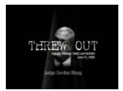
voted to throw out the conviction of a man who planned to kill his girlfriend