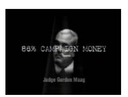
guilty plea of a man who beat a 15 year old boy into a vegetative state.