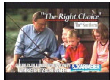
the right choice for Illinois Supreme Court. [PFB]: Illinois Republican Party