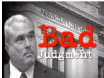
With a record of bad judgement, Maag is scolded for distorting