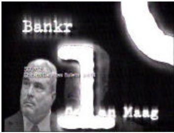
[Annoucer]: Trial lawyers are desperately trying to

Brand: POL-SUPREME COURT (B333) Parent: POLITICAL ADV Aired: 10/23/2004 - 10/23/2004 Creative Id: 3605203