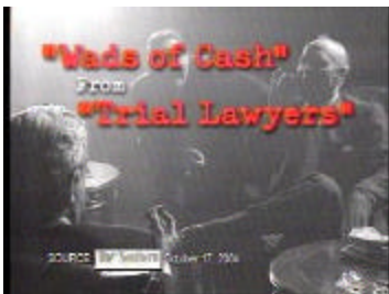
trial lawyers. Newspapers understand: it's a bad idea for