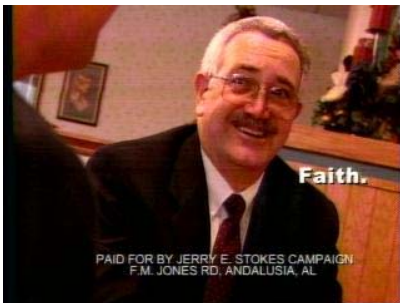
an outstanding member of the judiciary." Faith. Freedom. Alabama's values.