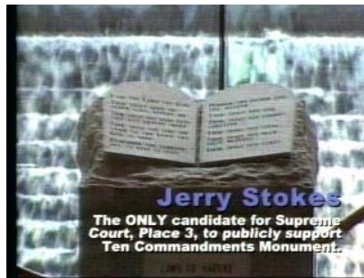
with the courage to speak out publicly in support of the Ten Commandments monument.