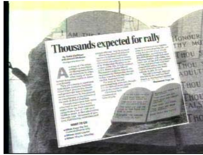
on which our laws and our freedom are built. Our people agreed.