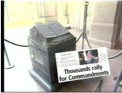
[Announcer]: It was an honest effort. Honor the moral principles

Brand: POL-SUPREME COURT (B333) Parent: POLITICAL ADV Aired: 05/26/2004 - 05/26/2004 Creative Id: 3422314