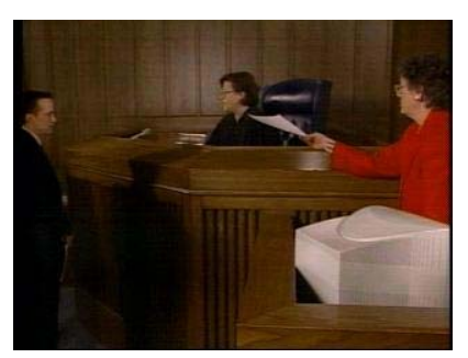
their victims in full. [Announcer]: Because she holds Review Court to collect fines and