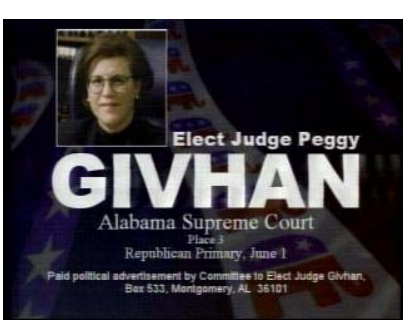
[Announcer]: Our kind of judge. [All]: Our kind of justice. [PFB: Committee to Elect Judge Givhan]