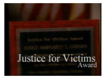
[Announcer2]: Judge Givhan keeps defendents who owe restitution on probation until they pay