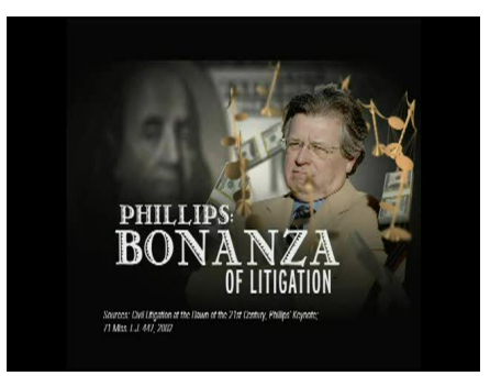
Phillips believes in a bonanza of lawsuits