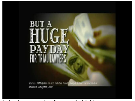
but a huge payday for greedy trial lawyers