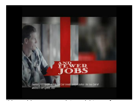
this could mean a regulatory nightmare for struggling small businesses and fewers jobs