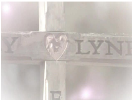
to have judges who protect them too