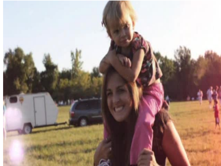
I vowed to spend my life protecting children