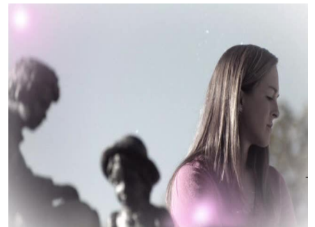
on victims of sexual assault and abuse