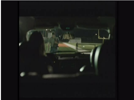
Well folks, the streak is alive

Brand: Democratic State Central Committee - (B339) Parent: PARENT UNKNOWN Aired: 10/1/2012 2:32:03 AM Creative Id: 11601808