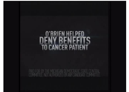
she worked to deny benefits to a cancer patient