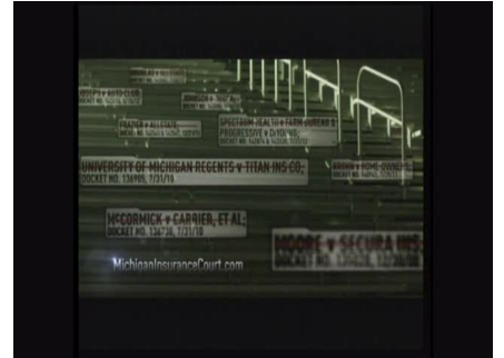
have sided with insurance companies over patients and providers in every opinion under the no-fault law