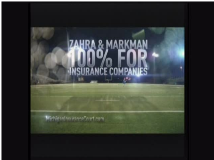
one hundred percent of the time