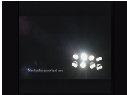
now they want to bring in former insurance lawyer Colleen O'Brien