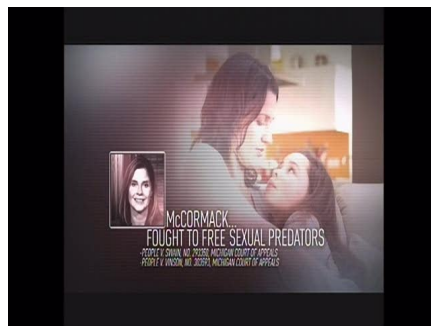
and fought to protect sexual predators