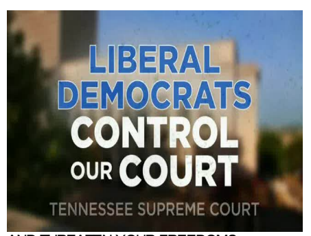
AND THREATEN YOUR FREEDOMS.