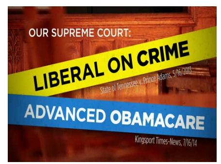
THEY ADVANCED OBAMACARE IN TENNESSEE.