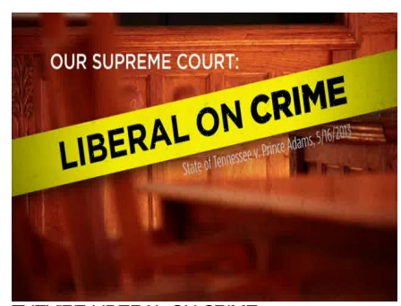
THEY'RE LIBERAL ON CRIME.