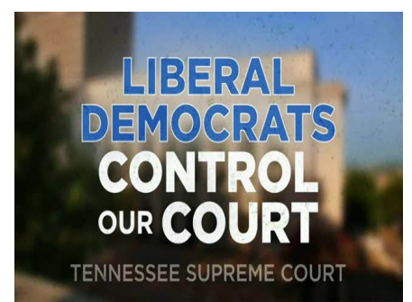
LIBERAL DEMOCRATS CONTROL OUR COURT