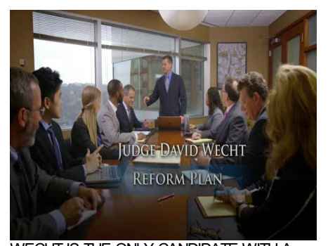
WECHT IS THE ONLY CANDIDATE WITH A PLAN TO RESTORE OUR TRUST IN THE COURT.