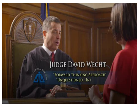
CITING HIS FORWARD THINKING APPROACH AND HIS UNQUESTIONED INTEGRITY.