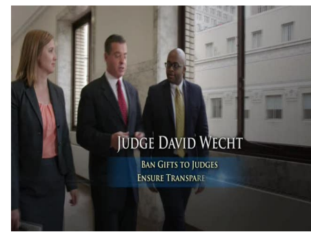
BANNING GIFTS TO JUDGES AND ENSURING TRANSPARENCY.