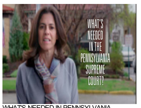
WHAT'S NEEDED IN PENNSYLVANIA SUPREME COURT?