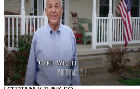
I CERTAINLY THINK SO.