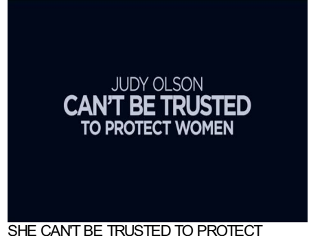
SHE CAN'T BE TRUSTED TO PROTECT WOMEN.