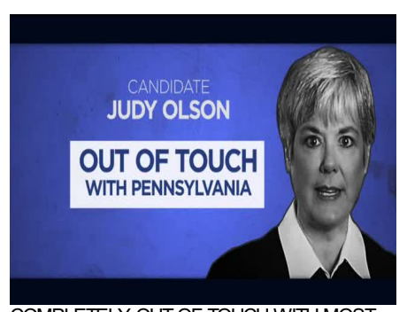
COMPLETELY OUT OF TOUCH WITH MOST PENNSYLVANIANS,