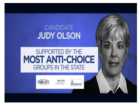
OLSON IS SUPPORTED BY THE MOST ANTI-CHOICE GROUPS IN THE STATE.