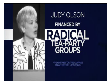
AND, OLSON IS FINANCED BY SOME OF THE MOST RADICAL TEA PARTY GROUPS IN PENNSYLVANIA.