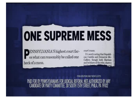
PENNSYLVANIA'S SUPREME COURT IS ALREADY A MESS.