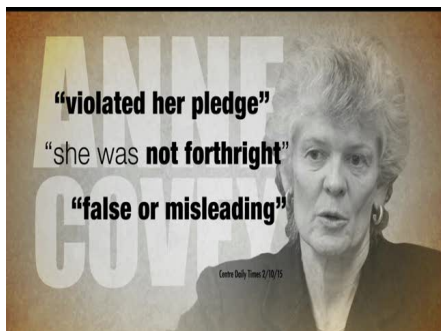
NOW, FOR GIVING DISHONEST ANSWERS, COVEY IS THE ONLY CANDIDATE FOR SUPREME COURT