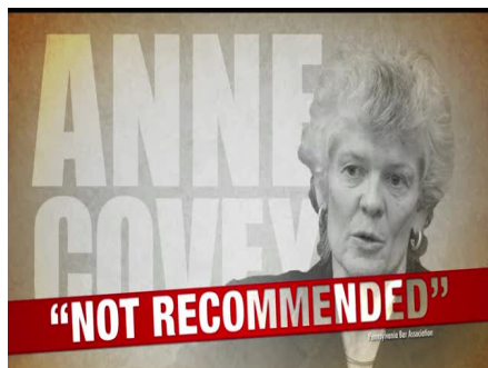
RATED NOT RECOMMENDED BY THE BAR ASSOCIATION.