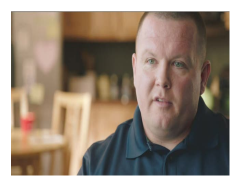
THERE'S NO QUESTION, VETERANS COURT CHANGED MY LIFE.