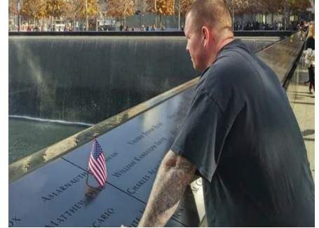
I AM MARRIED NOW.