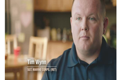
BEING A BIG BAD MARINE, YOU DON'T WANT TO ADMIT THAT SOMETHING'S WRONG WITH YOU.