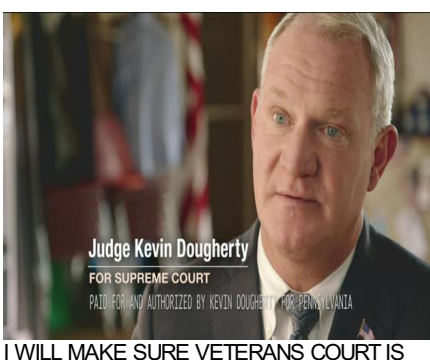
I WILL MAKE SURE VETERANS COURT IS EXPANDED SO THAT EVERY VETERAN IN PENNSYLVANIA HAS EQUAL ACCESS TO THIS SYSTEM.