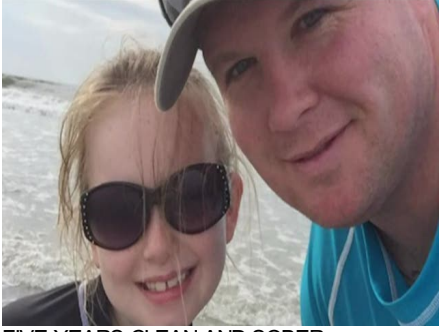
FIVE YEARS CLEAN AND SOBER.