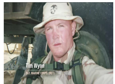
FOUR DAYS AFTER RETURNING I GOT ARRESTED.

Brand: Pol-Supreme Court - (B333) Parent: POLITICAL ADV Aired: 10/27/2015 9:38:32 AM Creative Id: 15734166