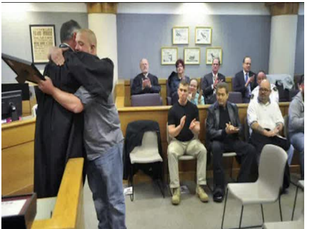
I WAS ABLE TO BE SURROUNDED BY VETERANS THAT ARE GOING THROUGH THE SAME THINGS THAT I'M GOING THROUGH.