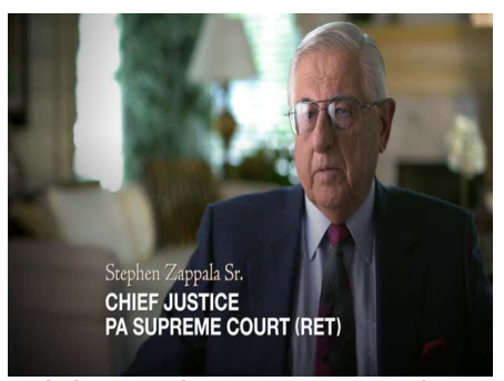
THIS IS THE FIRST TIME I HAVE PUBLICALLY ENDORSED ANYBODY.