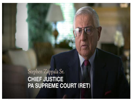
YOU HAVE TO HAVE PEOPLE WITH, HEART, WITH SOUL, AND THE ABILITY TO UNDERSTAND WHAT THE LAW IS AT THE SAME TIME.