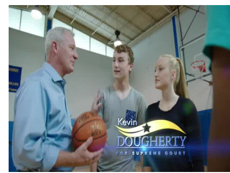
WHEN HE WENT INTO THE COURT SYSTEM HE COULD'VE BEEN ASSIGNED ANYWHERE