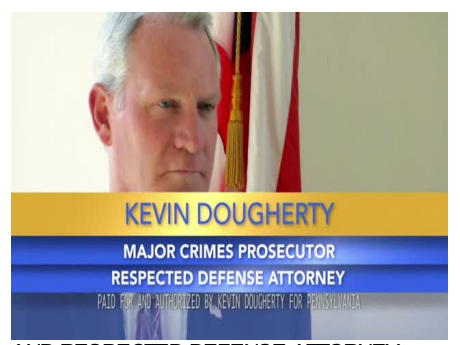
AND RESPECTED DEFENSE ATTORNEY.